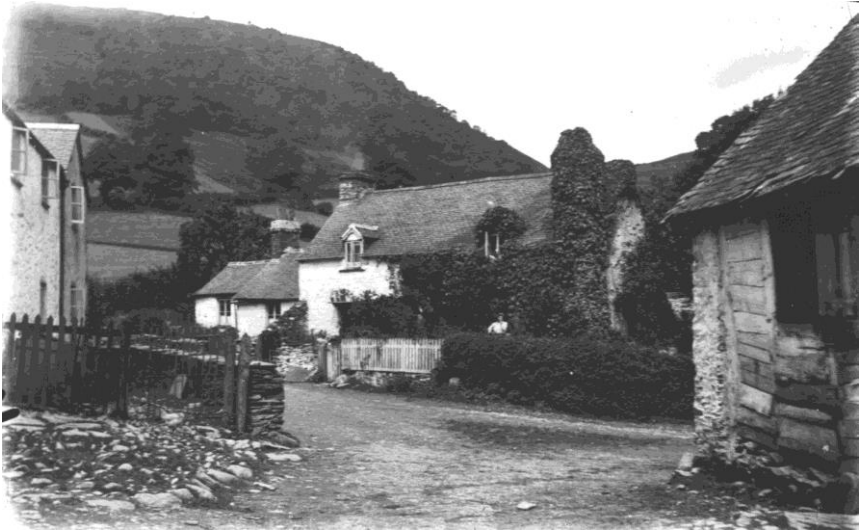
A view of Yr Efail and Rose Cottages, Pentredŵr, in the early 20th century.

In 1854 George Borrow visited a number of the villages around Llangollen. On one of his excursions he walked around the track from Plas yn Eglwyseg across to Pentredŵr. He recorded in his book Wild Wales :-