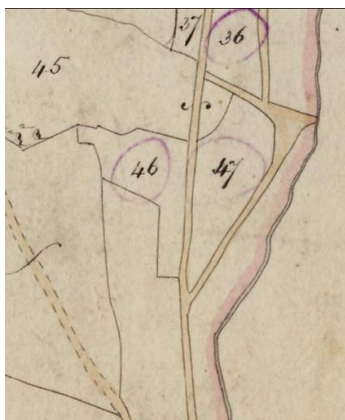
The 1841 tithe map.