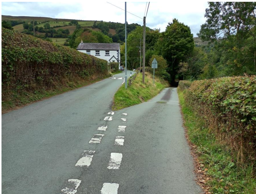
The site of Tan y Capel in 2023.

Tan y Capel (Under the Chapel) was a house that previously stood on the narrow strip of land opposite the Siloh Chapel, where the road forks down towards Pentredŵr Farm. Two Ordnance Survey drawings, one from 1819 and the other from 1835, both show this area of Pentredŵr. Tan y Capel is marked on both, although not labelled.