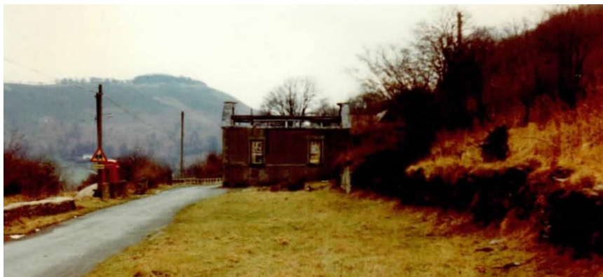
The ruined Siloh Chapel at the end of the 1970s.

However, the move away from religion, the dwindling population of Pentredŵr and the improvements in transport, allowing easy access to chapels in Llangollen, spelt the end for Siloh. The chapel closed in 1971 and fell derelict.