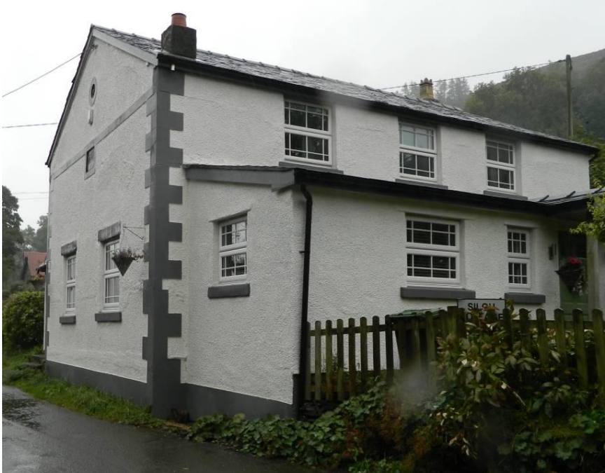
Siloh Cottage/Chapel in 2023.

The Royal Commission for Ancient and Historical Monuments in Wales 2009 report on the building said that “Siloh Wesleyan Methodist Chapel was built in 1816, rebuilt in 1844 with a long-wall entry plan and enlarged in 1865”.