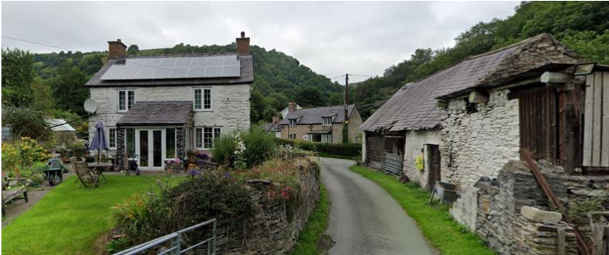
Pentredŵr Farm on the left, with the barn on the right, in 2023. The building behind in the middle is Yr Efail.

Pentredŵr Farm is situated in the middle of the village in the area that used to be called Yr Efail (the Smithy). It consisted of a farm house and