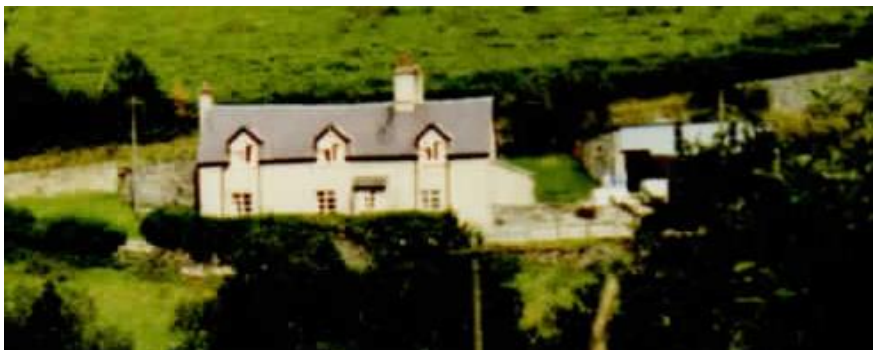
Pentredŵr Farm in 1988.