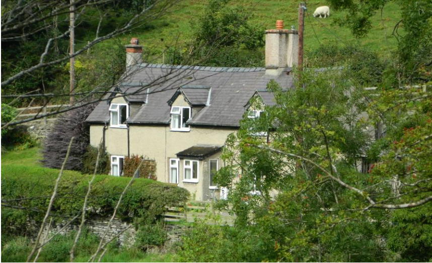
Pentredŵr Farm in 2023.