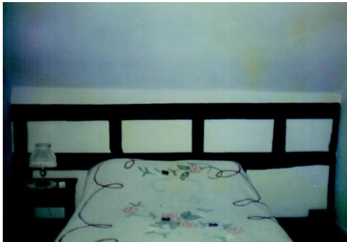
The timber framing exposed inside Pentredŵr Farm.