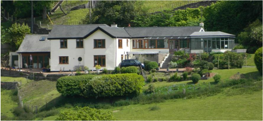
Holly Cottage in 2023, photographed from across the valley.

Holly Cottage doesn't seem to be included on John Evans' 1795 map of North Wales, although it was marked (though not named) on an Ordnance Survey map of the area from 1835, so possibly (although by no means certainly) it was built sometime in that forty year period.