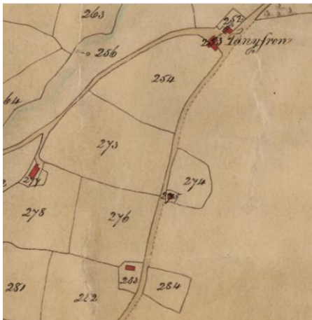
The tithe map of 1844. Holly Cottage is number 283, along with the field number 284.