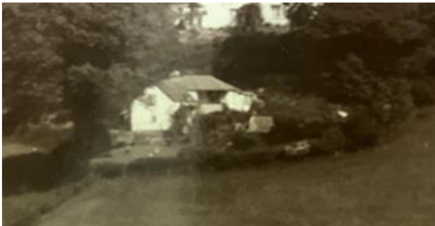
The building added behind the original cottage can be seen in this photograph of 1934.

can be seen to have been added by that time behind the original house. Curiously it remained (incorrectly) marked as a single building on the Ordnance Survey maps up until the latter part of the 20th century. Since that time Holly Cottage has been enlarged and extended by successive owners to form the much larger house that it is today.