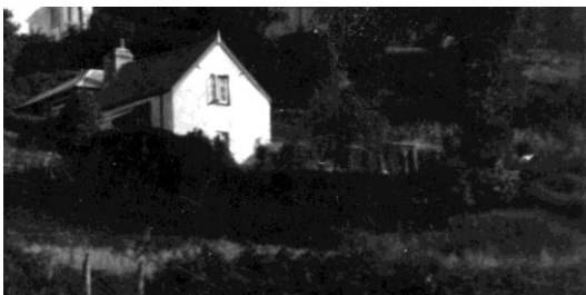
Holly Cottage in 1932.

On the title map, the building of Holly Cottage is marked as a single building, with its long axis pointing across the valley. This coincides with the building that can be seen with the gable towards us in a photograph from 1932, although an extension