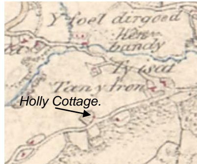
The 1835 Ordnance Survey map.

Holly Cottage doesn't seem to be included on John Evans' 1795 map of North Wales, although it was marked (though not named) on an Ordnance Survey map of the area from 1835, so possibly (although by no means certainly) it was built sometime in that forty year period.