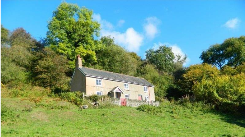
Glyn in 2023