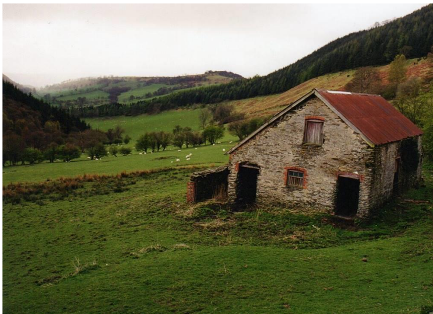
The barn at Glyn around 2010.