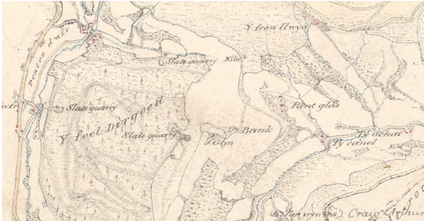
Glyn was marked on an 1835 Ordnance Survey Map.