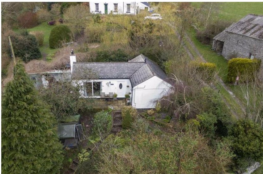
Gaia in 2020, with Tŷ'n y Pistyll behind.

The bungalow of Gaia today stands on the same site as one of the original Tŷ'n y Pistyll cottages, which in turn appears to have possibly been part of the original Tŷ'n y Pistyll Hall. However, none of the original building has survived to be incorporated into the house that stands today. Tŷ'n y Pistyll