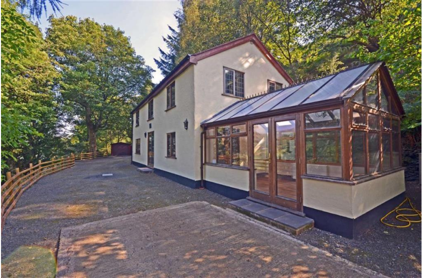
Fron Newydd in 2016.

Fron Newydd sits in the crook of the Horseshoe Pass road just below Oernant Uchaf. The fields were marked as Oernant on an 1819 Ordnance Survey drawing, but no buildings were shown in the area of Fron Newydd.