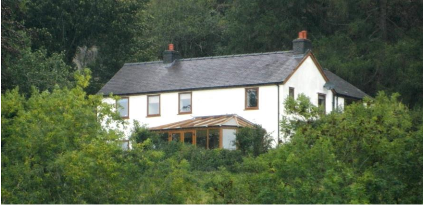
Fron Haul in 2023.