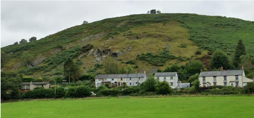
Abbey Terrace with Velvet Hill behind.

Maes y Llyn Cottages probably owe their origins to the slate industry and the haulage of slate to the slate mill at Pentrefelin. It is unclear when they were built. Maes y Llyn (Field of the Lake) Cottages and Abbey View are the older of the three buildings here – Plas Eliseg is much more modern. In the tithe survey of 1844 the area (No. 58) was marked as a cottage belonging to the Wynnstay Estate, lived in by a rockman, a boatman and two agricultural labourers. Both Abbey View and the cottages appear on an 1868 map of the area, when it is noted that Thomas Lloyd, one of the agricultural labourers, still lived at Abbey View.