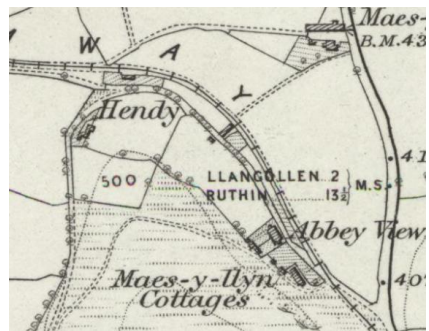
The 1873 OS map.

On the 1873 Ordnance Survey map three buildings are marked in that area of land – Maes y Llyn Cottages, Abbey View and Hendy.